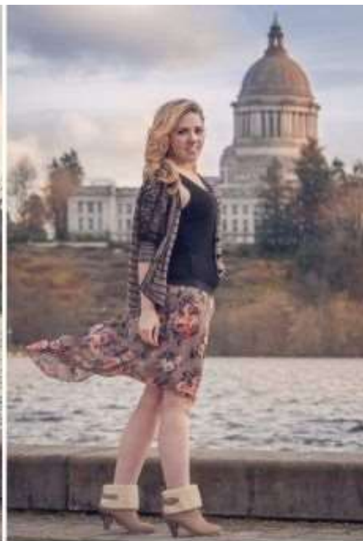
135MM 2.0 LENS