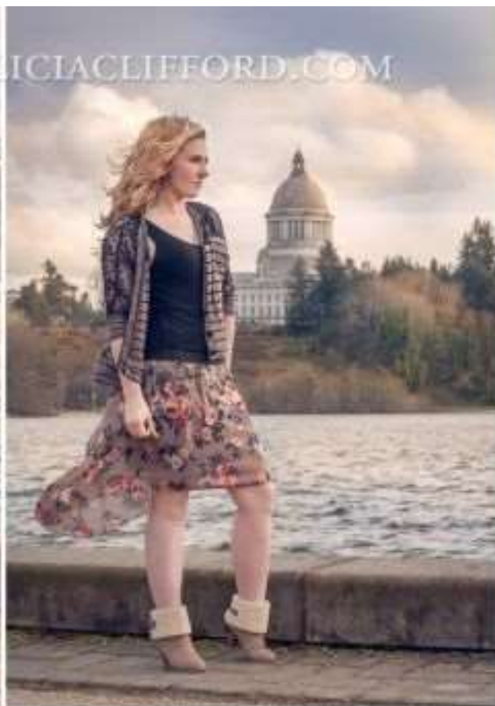
85MM 1.2 LENS