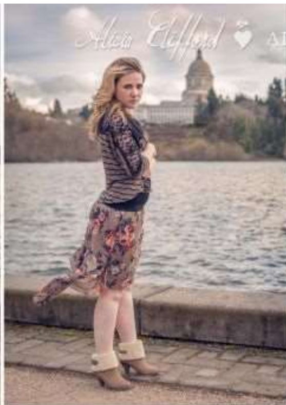
50MM 1.4 LENS