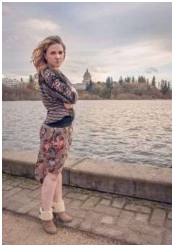
24MM 1.4 LENS